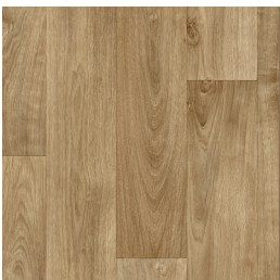
Natural Oak Pattern Repeat: 99.50x100