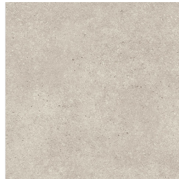
Moonscape Pattern Repeat: 100x100