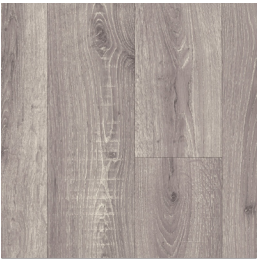
Distressed Oak Pattern Repeat: 99.50x100