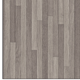
Butcher Block Steel Pattern Repeat: 99.50x150