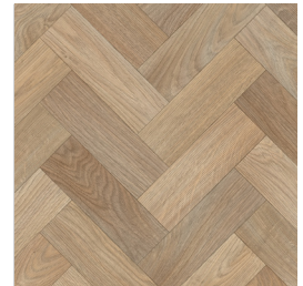
Natural Herringbone Pattern Repeat: 99.50x100