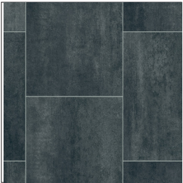
Lakeland Slate Pattern Repeat: 100x100