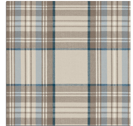
Harris Pattern Repeat: 99.50x100