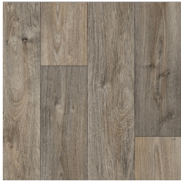
Fossilised Oak Pattern Repeat: 99.50x100