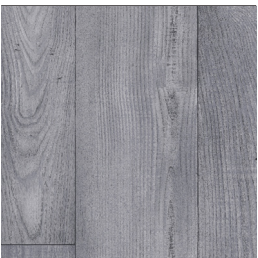
Smoked Oak Pattern Repeat: 99.50x120