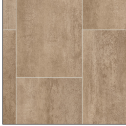
Autumn Slate Pattern Repeat: 100x100