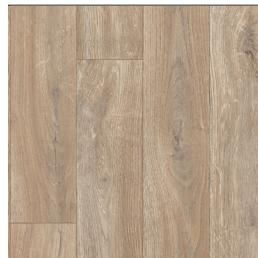
Summer Oak Pattern Repeat: 99.50x120