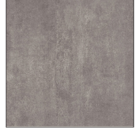
Ceramica Pattern Repeat: 100x100