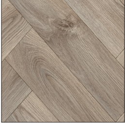
Aged Herringbone Pattern Repeat: 199x100