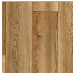
Sunrise Oak Pattern Repeat: 100x120