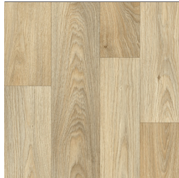
Morning Oak Pattern Repeat: 99.50x150