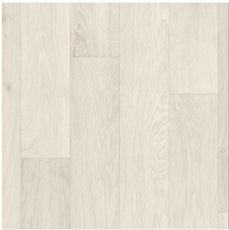
Coastal Oak Pattern Repeat: 100x120