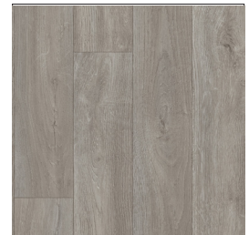
Winter Oak Pattern Repeat: 99.50x100