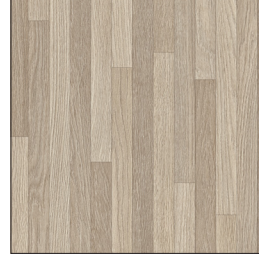
Butcher Block Stone Pattern Repeat: 99.50x150